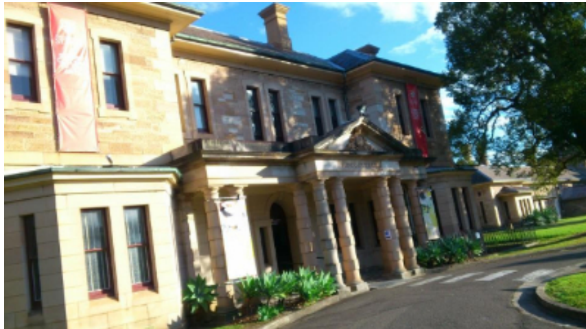
Sydney College of the Arts

"Torch Fired Plique a jour Enamelling" is cheap, efficient and low consumption of gas fuel. This is the best Enamelling procedure and you'll find it easy to do. A selection of my jewellery and samples will be on show to aid your understanding of this unique procedure.