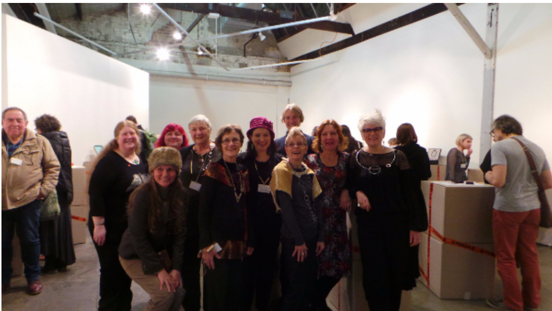
JMGA WA Members at the Opening Night of In-Transit.

In-Transit review coming in the next edition of JMGA News.