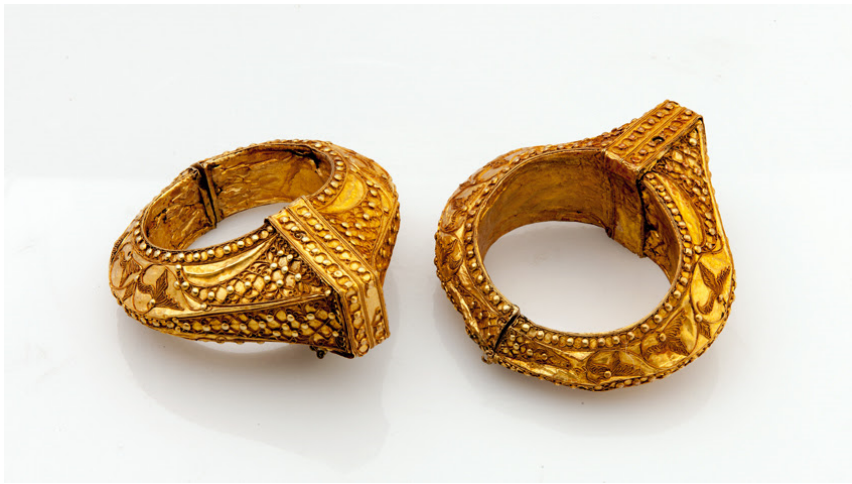
Indonesia Pair of bracelets [galang gadang] 19th century, Minangkabau highlands region, West Sumatra. Gold, 9.7 x 8.5 x 4.0 cm each, 30 grams (weight). Truus and Joost Daalder Collection, Adelaide