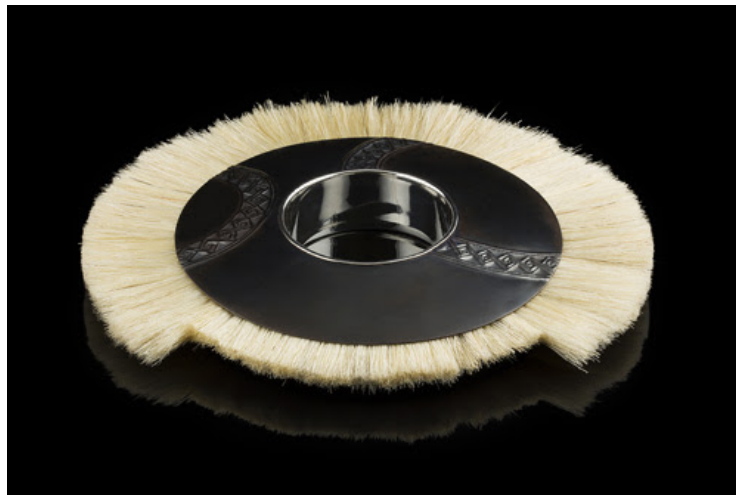
Fatemeh Boroujeni | Title: It is all about me | Material: Oxidised copper, brush bristles, fine silver, 2015 | Dimensions: 230x230x30mm