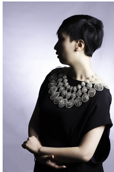
Elizabeth Hawkley | Inner Eye Collar |2016 | Sterling Silver | OD 380mm ID135mm Height12mm