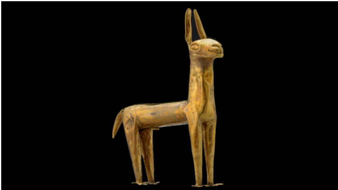
Image: Inca gold llama statuette, C 1500, Peru. British Museum.