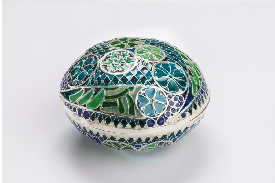
Image: Jill Parnell. Beauty can you feel it , pique a jour box, 100mm diameter.