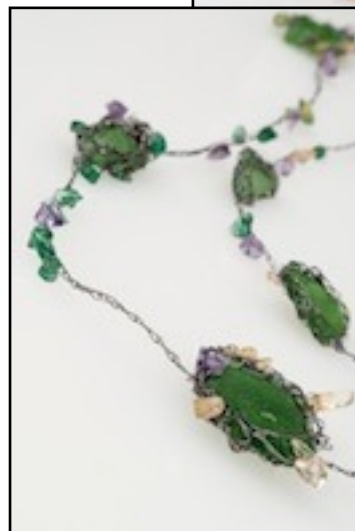
Images - work by Tineke Van der Eecken Rock Pool Rhythms - necklace in silver with beach glass, amethyst and vitrines Opal in gold - ring in gold filled wire with opal